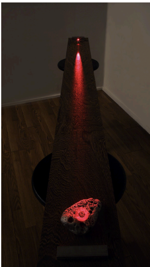
Transmission Master on glass. 10cm x 12.5 cm. Panga Panga 2.3m x 20cm x 20cm.