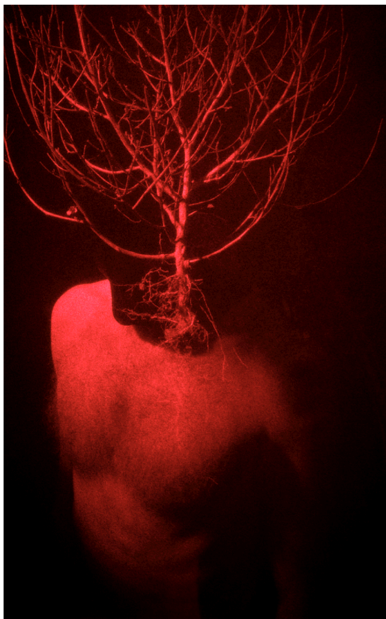
Vestigial Root. 1991, Pulsed-Ruby Transmission Master on glass. 30cm x 40cm.